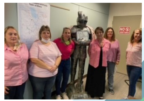
Town of Ithaca