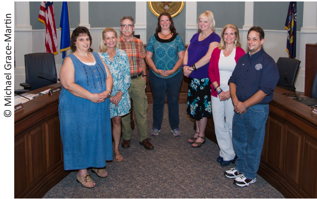
The Owning Your Own Health Committee.

Congratulations! We should all be very proud of this data. These percentages are higher than other Excellus groups in Central New York. Preventative care is important to controlling premium costs. This data confirms there is an overall awareness of the value of preventative health care among Consortium subscribers.