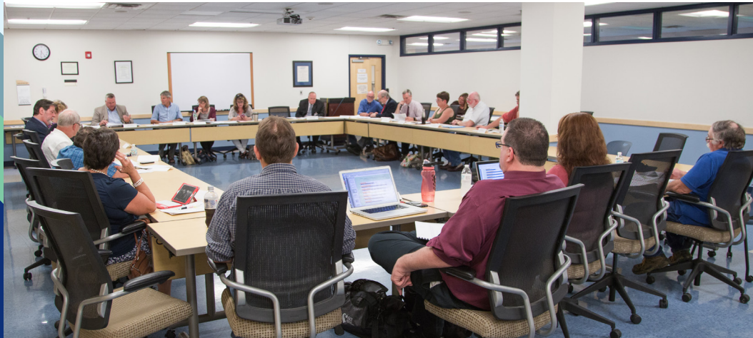
The Consortium Board of Directors discussed premium rates at their latest meeting.