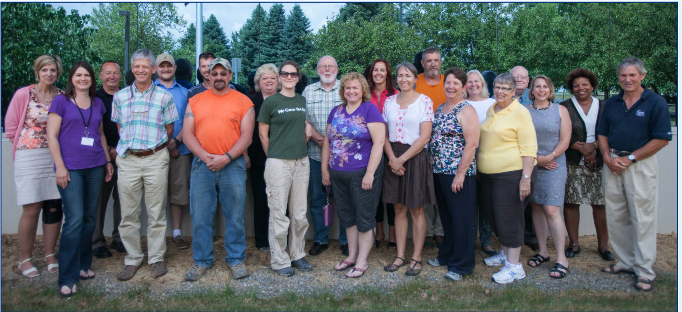
The Joint Committee on Plan Structure and Design.